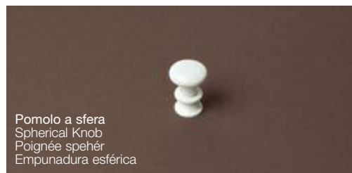
Pomolo a sfera Spherical Knob Poignée spher Empunadura esférica