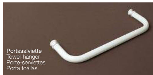
Portaservietta Towel-hanger Porte-serviettes Porta toallas