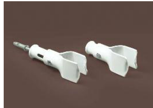
Kit montaggio attacco a bandiera Mounting kit for installation as partitions Kit d'assemblage pour les séparateurs kit de montage para instalación por partes