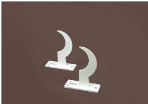
Staffa RMC Brackets for RMC Etriers d'assemblage pour RMMC Horuilla de montaje