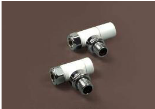
Valvola e detentore "cilindrico" Cylinder valve and holder Soupape et detenteur "cylindrique" Válvula y detentor "cilindrico"