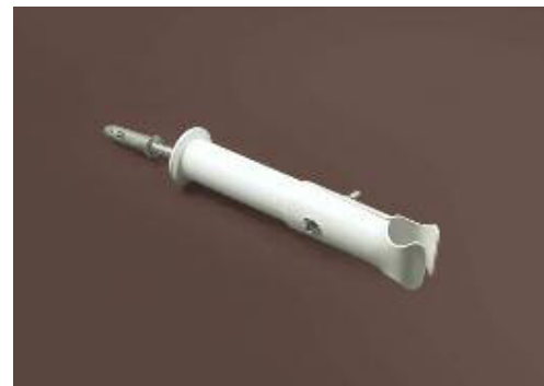
Piedino per scaldasalvietta Foot for towel heating Piétement chauffage serviette Pie para calentatoalla