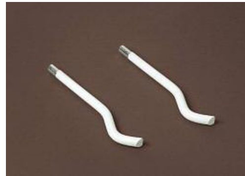
Mensola RMC RMC Shelf Étagère RMC Balda RMC