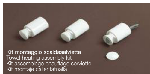
Kit montaggio scaldaservietta Towel heating assembly kit Kit assemblage chauffage serviette Kit montaje calentatoalla